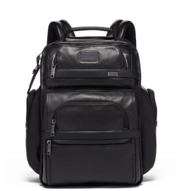
Alpha 3 Brief Pack® Leather by Tumi™ Catalog #: 30-7426