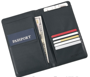
Passport Travel Wallet by Samsonite® Catalog #: 33-6575 Points: 3,500