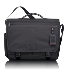
Corporate Collection Messenger by Tumi™ Catalog #: 39-9502 Points: 20,900