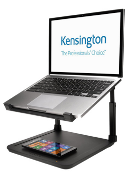
Kensington SmartFit Laptop Riser with Qi Wireless Phone Charging Pad by Kensington Catalog #: 30-7971 Points: 16.000