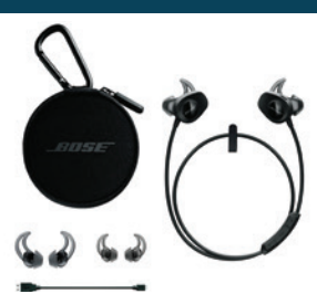
SoundSport® Wireless Headphones by Bose® Catalog #:38-4036