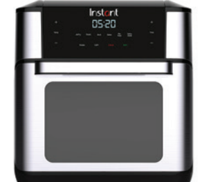
Instant<sup>™</sup> Vortex<sup>™</sup> Plus Air Fryer Oven by Instant Pot® Catalog #: 31-6199

Bathroom Digital Scale by Vivitar® Catalog #: 30-2949