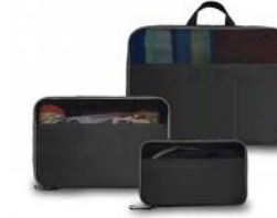
Jetsetter 3-Piece Packing Cube Set by Gemline® Catalog #: 30-5152 Points: 3,100