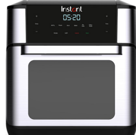
Instant™ Vortex™ Plus Air Fryer Oven by Instant Pot® Catalog #: 31-6199 Points: 21,100