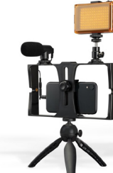
All-in-One Vlogging Kit with Tripod by Gpx® Catalog #: 20-7452 Points: 10,500