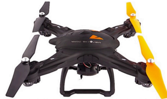
"Follow Me" GPS + Wi-Fi HD Camera Drone by Vivitar® Catalog #: 30-5818 Points: 29,600