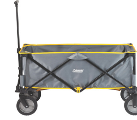
Outdoor Collapsible Wagon by Coleman® Catalog #: 20-3140 Points: 17,600