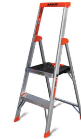
Flip-N-Lite 4-Foot Aluminum Stepladder by Little Giant® Catalog #: 37-8340 Points: 13,700