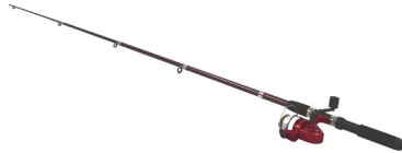
Telescoping Fishing Pole Set by Simcor Catalog #: 36-3354 Points: 6,200