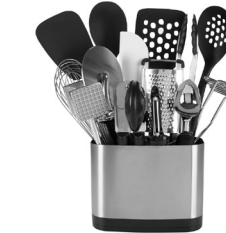
15-Piece Everyday Kitchen Tool Set by OXO® Catalog #: 37-0250 Points: 11,600