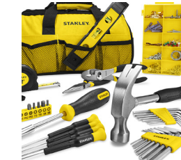
38-Piece Mixed Tool Bag Set by Stanley® Catalog #: 30-5405 Points: 4,900