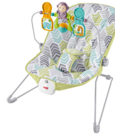
Baby's Bouncer by Fisher-Price® Catalog #: 39-9921 Points: 6,400