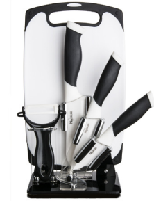
16-Piece Ceramic Knife Set with Cutting Board by New England Cutlery® Catalog #: 37-8165 Points: 5,000