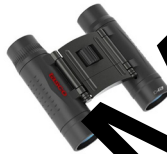
Tasco® 10 x 25mm Binoculars Catalog #: 30-0428 Points: 13,100