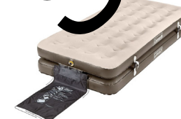
4-in-1 QuickBed® Air Bed by Coleman® Catalog #: 38-8255 Points: 9,600