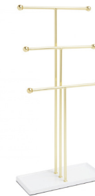
Trigem Jewelry Stand, White/Brass by Umbra® Catalog #: 39-8764 Points: 4,300