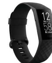
Fitbit® Charge™ 4 Fitness Tracker with Health Rate & GPS Catalog #: 20-6952 Points: 21,300