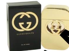
Women's Guilty Pleasure 2.5 oz. by Gucci® Catalog #: 31-0056 Points: 12,300