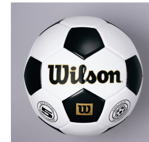
Traditional Soccer Ball by Wilson® Catalog #: 37-8882 Points: 3,500