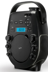
Bluetooth® Multi-Media Projector and DVD/CD+G Player with Karaoke by iLive Catalog #: 39-5970 Points: 18,000