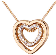
E Gold Heart Necklace by Diane Katzman Design Catalog #: 38-8001 Points: 3,200