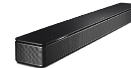
Soundbar 500 by Bose® Catalog #: 20-7197 Points: 16,500