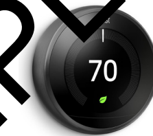
Learning Thermostat 3rd Gen by Nest® Catalog #: 30-4807 Points: 35,700