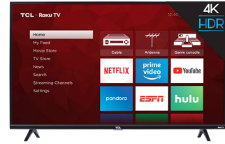
50-inch 4K Ultra HD Roku TV by TCL Catalog #: 20-6927 Points: 89,000