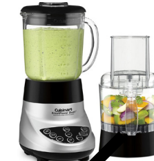
SmartPower Jet® 500 Watt Blender/Food Processor by Cuisinart® Catalog #: 31-0988 Points: 15,200