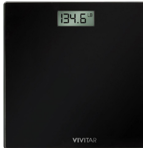
Bathroom Digital Scale by Vivitar® Catalog #: 30-2949 Points: 4,000