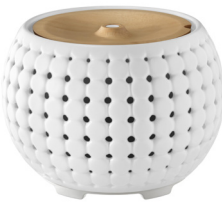
Gather Diffuser by Elia Catalog #: 39-2577 Points: 10,600