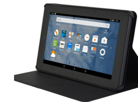
Fire HD 8 32GB Tablet - Black with Leather Cover by Amazon Catalog #: 39-6572 Points: 18,200