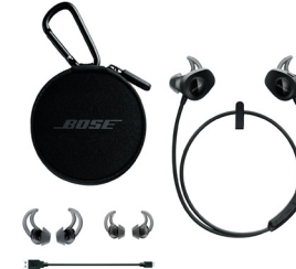
SoundSport® Wireless Headphones by Bose® Catalog #: 38-4036 Points: 16,500