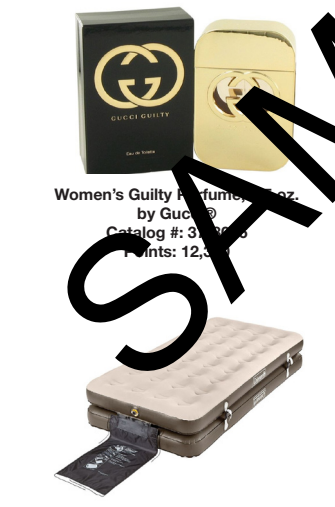
4-in-1 QuickBed® Air Bed by Coleman® Catalog #: 38-8255 Points: 9.600