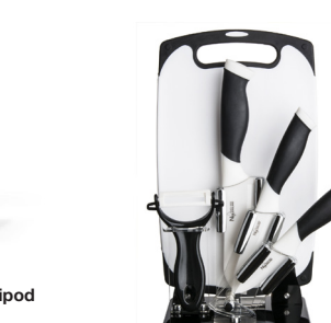
16-Piece Ceramic Knife Set with Cutting Board by New England Cutlery® Catalog #: 37-8165