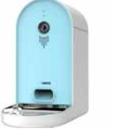
Automatic WiFi Dog and Cat Smart Feeder with HD Camera by DOGNESS Catalog #: 20-3738 Points: 25.200