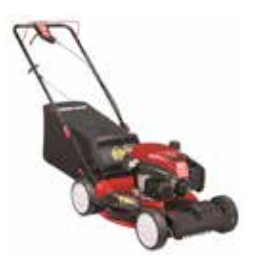
Trov-Bilt® TriAction® 21" Front Wheel Drive Self-Propelled Mower Catalog #: 30-8557 Points: 53,000

Due to new product introductions throughout the year, models pictured may be discontinued and no longer available. Please refer to the program website for the most current assortment of available choices.