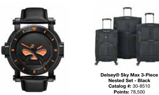
Harley Davidson® Mens Black Strap Watch Catalog #: 30-8506 Points: 21,700