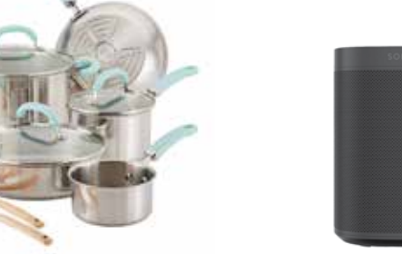
Create Delicious 10-Piece Stainless Steel Cookware Set - Light Blue Handles by Rachel Ray® Catalog #: 31-7229 Points: 36,200